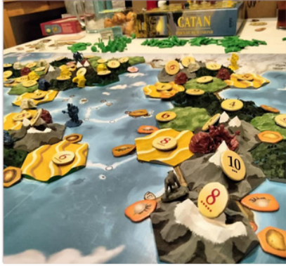
Melita: 3D-printed Catan Game Night!